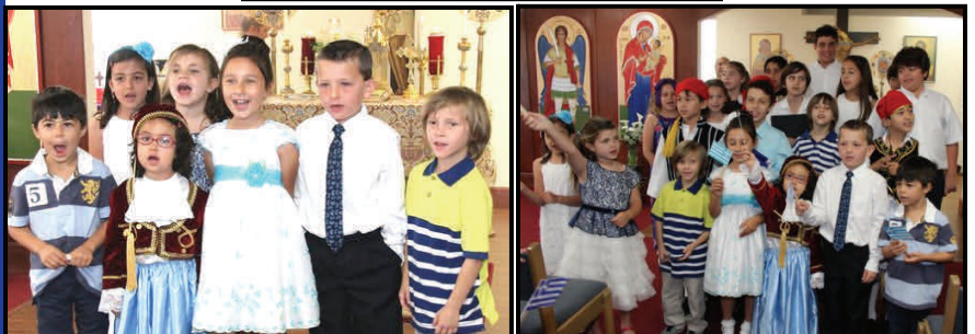
Greek School singing for Greek Ind. Day

Our offerings: stewardship is composed of our personal offering of time, talent and treasure. Stewardship is not dues. Time and talent offerings are difficult to measure. Treasure, is much more black and white. As a Parish, it costs us approximately $27,000 per month to run our church. When the stewardship program was implemented, our goal was to have 130 stewards with an average pledge of $2,500 per pledged household. This would allow us to meet all of our Parish obligations and support our thriving ministries. Year to date, we have 84 pledged stewards for a total of $152,300. This is an average of $1,831 per pledged household. While this is the best pledged stewardship position we have been in for a long time, there is still much to do. Our Parish is 46 pledged stewards short of our goal. I invite everyone to encourage others of our family and friends to attend our parish. By increasing our pledged membership, we can accomplish our goals. With more members, the finances will come in line. I ask that each of you invite someone new to church this Lenten season, and together, let's get them involved in our church. I have faith and belief in our community and with all of us working together, we can continue to grow a thriving, growing Orthodox community in South Orange County. Thank you for your love, your labor and your treasure in support of our Parish, and Our Lord Jesus Christ. Maynard Rains, Stewardship Chairman